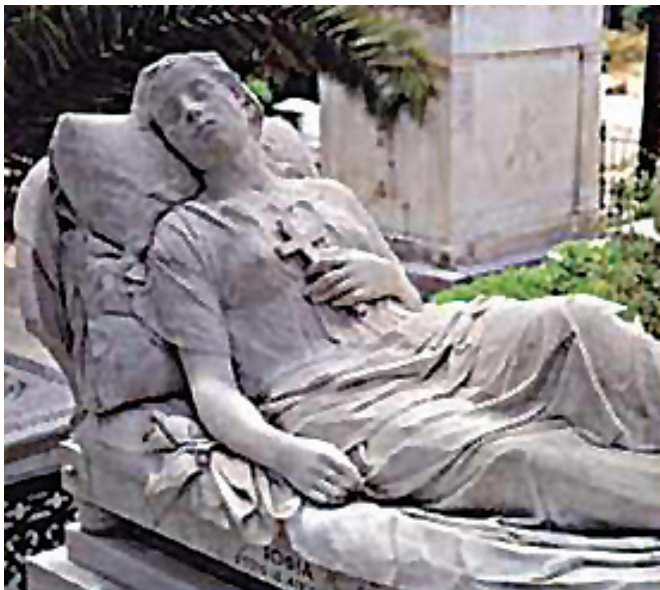
Sleeping Female (1877) at the Tomb of Sofia Afentaki, First Cemetery of Athens